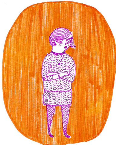
EARLY CAREER RESEARCHER